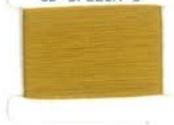
GD SPEZIA S