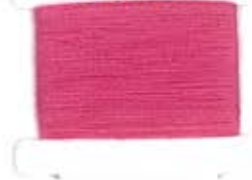
PJ DALIA S