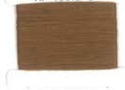
RF RAMO S