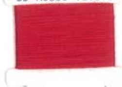
S5 ROSSO VIVO S