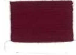
4H CICLAMINO S