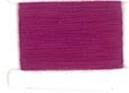
4M RUBINO S