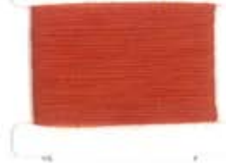
GV TRAMONTO S