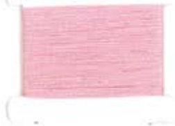
NA SABINA C