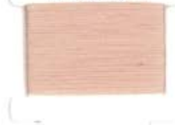
5P POWDER M