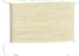
P2 SAHARA C