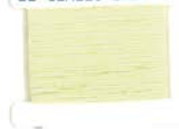
2E GIALLO BABY C