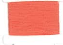
PY ASTICE M