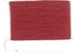
2G TERRACOTTA S