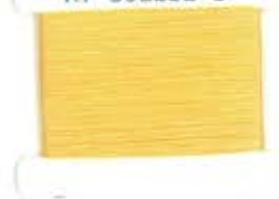
RT SOLEIL S