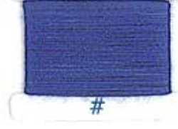
AP BLU ROYAL