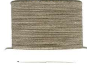
8W SPIGA S