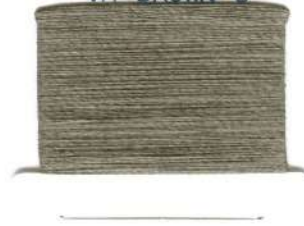
VM BROWN S