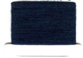
W6 INDIANO S