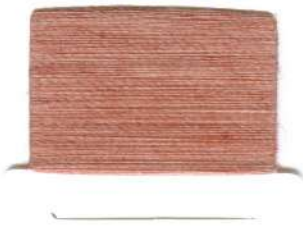
VP CORAL S