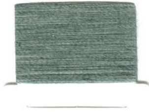
1G GREEN S