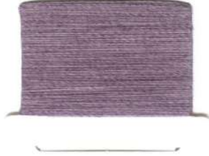
4L BOUQUET S