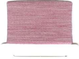
4E BON BON S