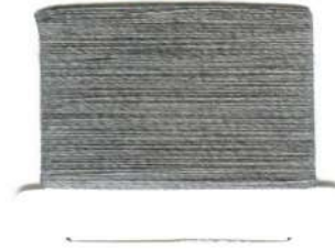
VN LONDRA SS