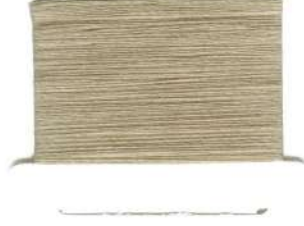
7X PIUMA S