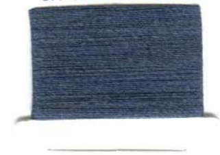
8X ATLANTICO S