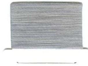
7Y IGL00 S