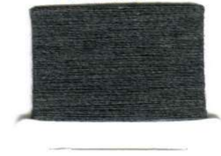
F8 BLACK S