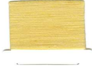
1E ZABAIONE S