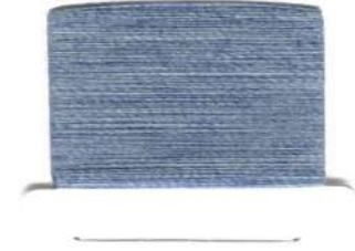
1F JEANS S